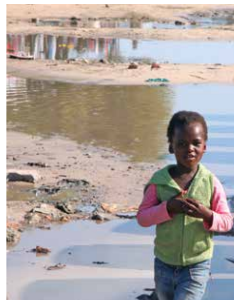
Informal Settlement, Cape Town, South Africa

If you are interested in receiving a copy of the excerpt, please send an e-mail to the Fund, at humanityfund@usw.ca , with your mailing address and contact information. ■