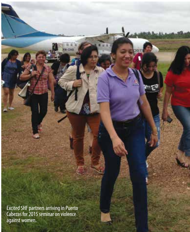
Excited SHF partners arriving in Puerto Cabezas for 2015 seminar on violence against women.

In Tete, Mozambique, mining is booming. Companies and governments talk about the great opportunity for the country. Academics and media outlets repeat what they hear as an unquestionable truth. The people living in the areas in which mines have been opening have another story to tell: a story of displacement, loss of traditional agricultural land, promises of jobs never fulfilled, schools for children moved away and doctors for the elders that never arrived. The Steelworkers Humanity Fund partnered with Association for Community Legal Support and Defense (AAAJC), Bench Marks Foundation and Sekelekani to give those communities the opportunity to tell their stories. The main goals of the project are to teach them how to write articles, prepare radio programs and podcasts, make videos and upload them on the internet and insert information in crowd-mapping. Those tools will give them a chance to be heard at home and abroad. ■