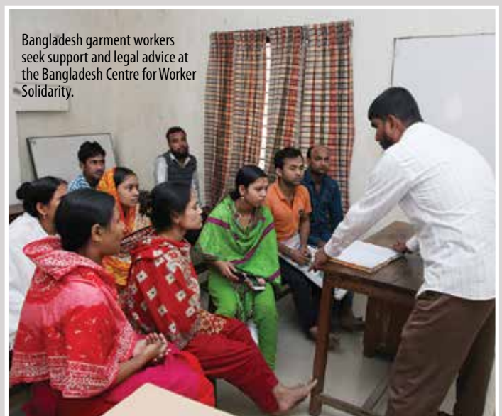
Bangladesh garment workers seek support and legal advice at the Bangladesh Centre for Worker Solidarity.

Together with other Canadian trade unions the Steelworkers Humanity Fund supports a project with