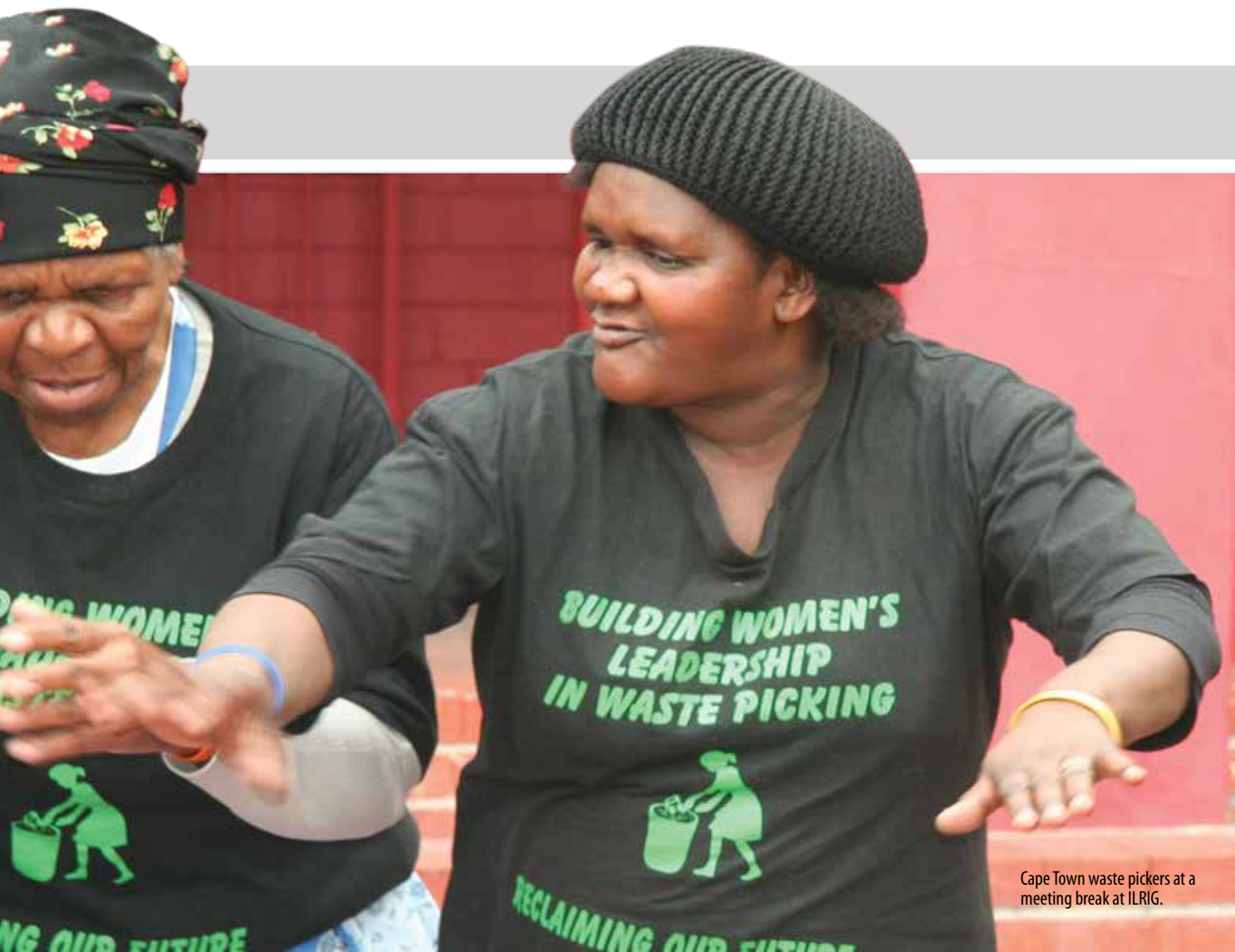
Cape Town waste pickers at a meeting break at ILRIG.

need, but the 11-month program is life changing for many of the participants. ■